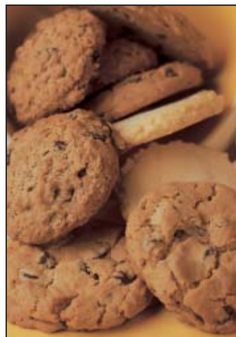
Nielsen-Massey's new vanilla blends can accent baked good such as cookies.

As leaders in the vanilla industry, Nielsen-Massey recognizes the growing concerns about the rising price of vanillas, and has instituted a ground-breaking program to help their customers deal with the fluctuations of the marketplace.