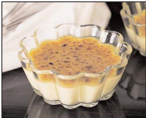
Pure Orange Extract is ideal for adding to recipes for rich, delicious desserts like crème brûlée.

Oranges, originating in Southeast Asia, are now grown throughout the world. Florida, California and Arizona are the top growing regions in the U.S. (Florida is number one). Oranges are the third most popular fruit in the U.S., behind bananas and apples. Christopher Columbus brought