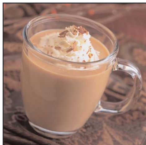
Make it a mocha-latté with Pure Chocolate Extract.

brownie, a hot fudge sundae, a mocha-tini or latté.... some people just "gotta have chocolate!" Well, Nielsen-Massey can make adding a bit of chocolate to your product easy with its new Pure Chocolate Extract.