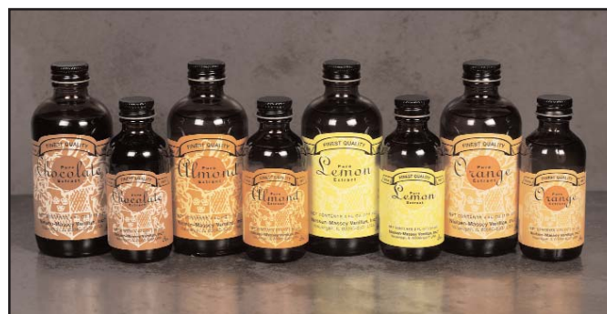
Nielsen-Massey's four new extracts: chocolate, almond, lemon, and orange.

The new products were recently introduced at the Summer Fancy Food Show, this July in New York.