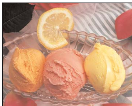
Wake up frozen treats with Pure Lemon Extract.

One can even cook the rind with sugar to make a candied lemon peel treat. And the lemon oil, or extract, comes from the rind.