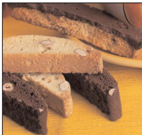
Enhance baked goods such as biscotti, with a touch of Pure Almond Extract.

The almond is a small, yet mighty nutmeat. Noted for their mild, rich flavor, almonds are an excellent source of Vitamin E and many other vitamins and minerals. We eat them by the handfuls, candy-coat them, and toss them in our salads. The almond is a tasty treasure loved by many. Now, a touch of almond can be added with Pure